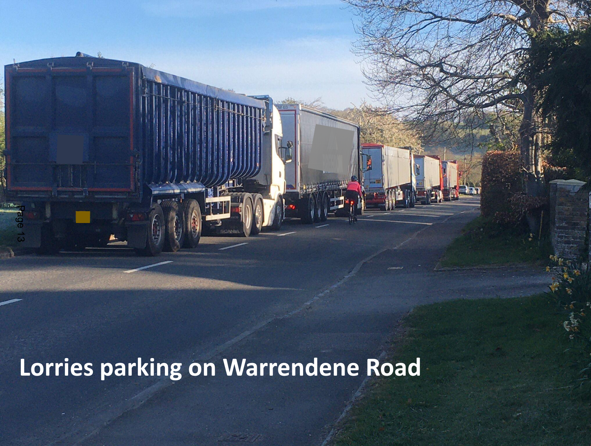
Lorries parking on Warrendene Road